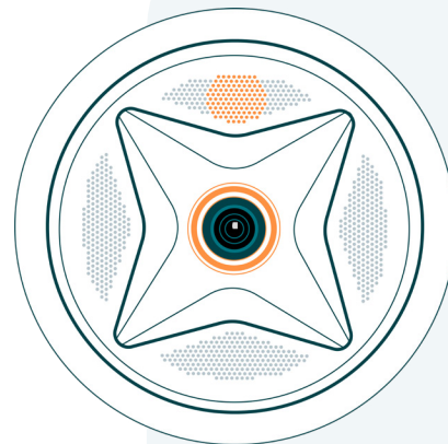
Guardian® Ceiling Device

To learn more about AvaSure Episodic, contact sales at info@avasure.com or contact us at 1.800.736.1784 .