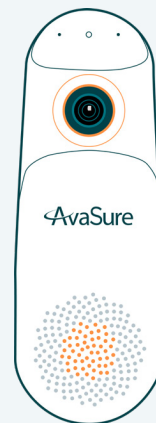
Guardian Access® Device